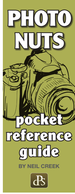
Photo Nuts Pocket Reference Guide

This is a quick guide to get you started with various situations. camera settings in various situations. They are only suggestions, but a great starting point.